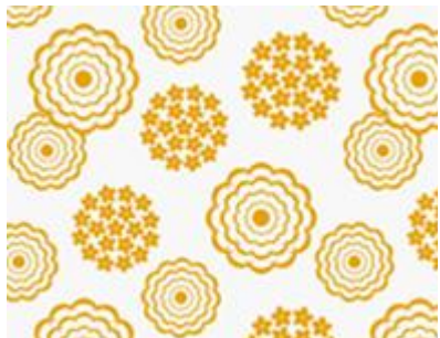
COTTAGE GARDEN Hemp/Organic Cotton