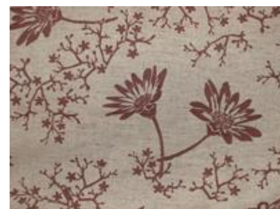
MARGUERITE Organic Cotton