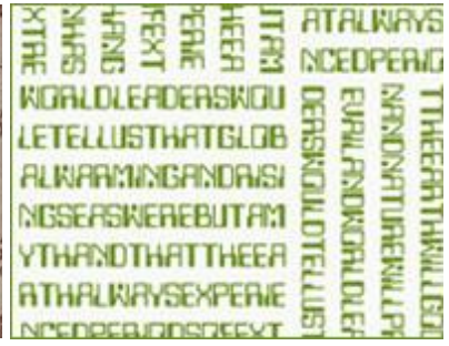
NATURE WILL PREVAIL Hemp/Organic Cotton