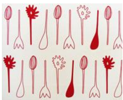
SPOON & WHISK Hemp/Organic Cotton