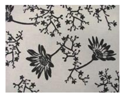
MARGUERITE Hemp/Organic Cotton