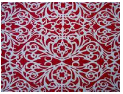
FRETWORK Hemp/Organic Cotton